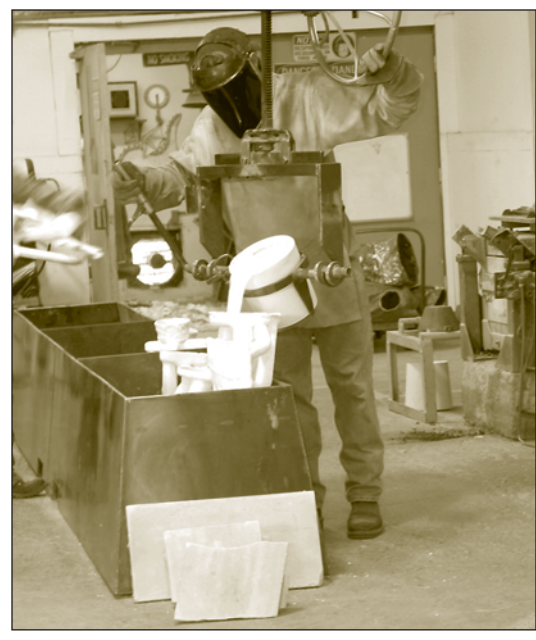
Arts production and entertainment character areas overlay existing industrially zoned land and provide artists with large-scale production facilities.

The neighborhood arts and production character areas on the edge of residential neighborhoods provide compact artist production space compatible with abutting neighborhoods.