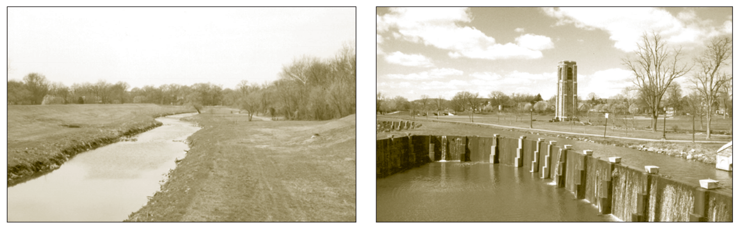
The stream valley, as it exists, is barren and uninviting. With appropriate improvements, the stream valley park can become a destination point in the center of the Arts District.

The stream valley park character area provides a green oasis in the center of the Arts District, allowing for recreation, contemplative spaces, and arts programming in open-air venues. The stream valley park character area overlays land generally located in the floodplain that has been reserved to protect the tributaries to the Anacostia River and is a part of the Anacostia Trails Heritage Area (ATHA). This character area bisects the Arts District and US 1.