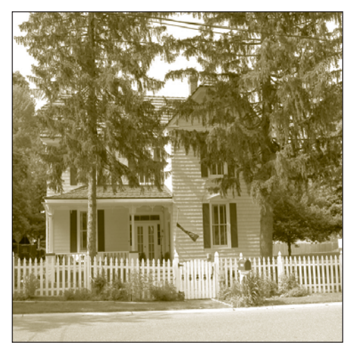
In many ways the traditional residential neighborhood character areas suggest a glimpse of small-town Americana.

In many ways, the traditional residential neighborhood character areas suggest a glimpse of small town Americana. They overlay land zoned for single-family housing (attached and detached). The historic houses and streetcar suburban pattern of interconnecting narrow streets and shaded sidewalks within easy access to town centers and Metro are assets to be